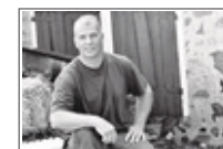
Pieter van Hiel/staff | Nov 26 The face of farming